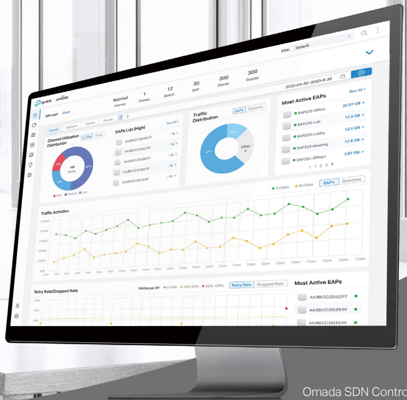
Omada SDN Controller